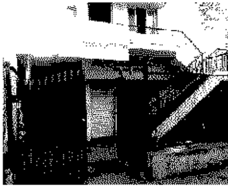
Pelling Station Building Front View