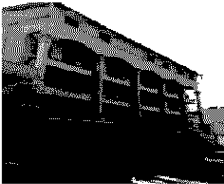
Poling Station Building Front View