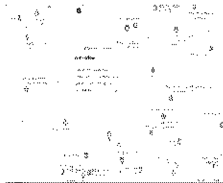
Google Map View