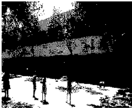
Poling Station Building Front View