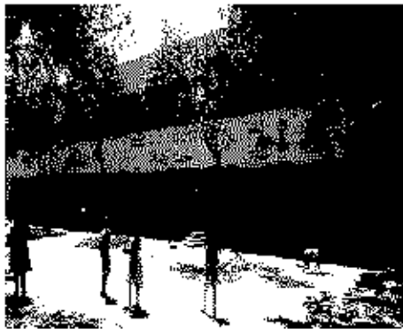
Poling Station Building Front View