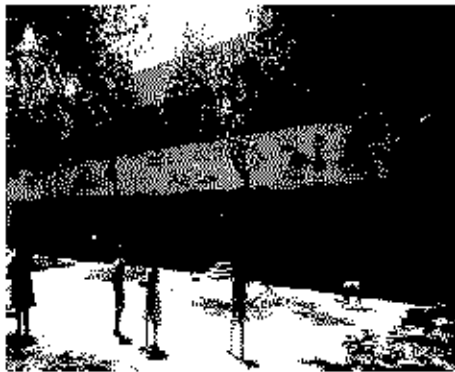
Poling Station Building Front View