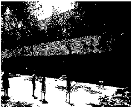
Poling Station Building Front View