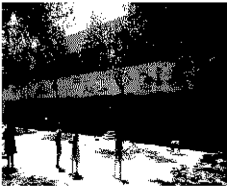
Poling Station Building Front View