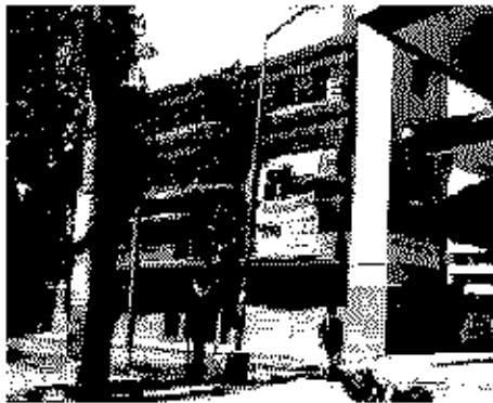
Poling Station Building Front View