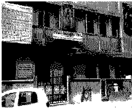
Polling Station Building Front View