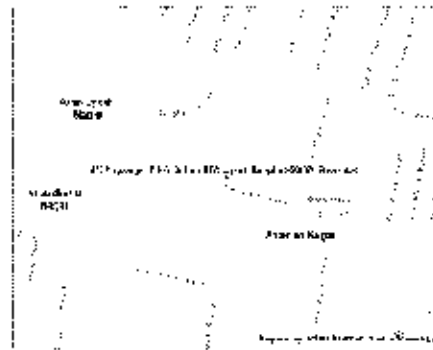
Google Map View