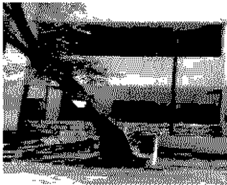
Poling Station Building Front View