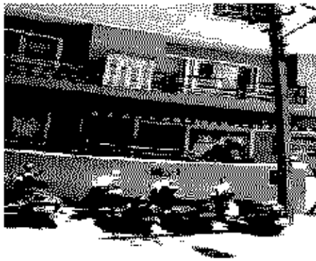
Poling Station Building Front View