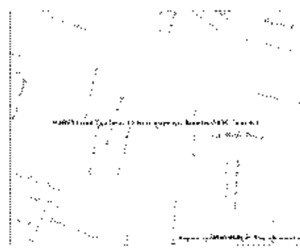
Gingla Map View