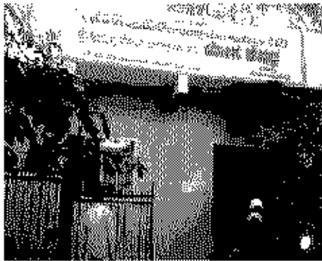
Poling Station Buiding Front View