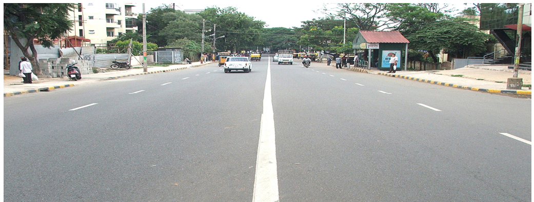
80 ft Road Indiranagara Completed Footpath & Road